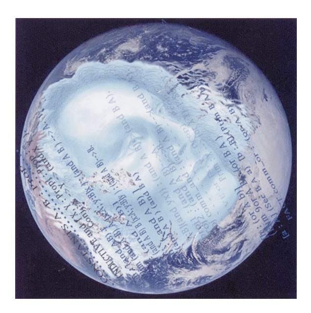
Fig. 2 Blue Planet Calling. Reproduced by permission. Created by artist C. Bangs, New York, in 2003, especially for Astrolinguistics

magnitude of them cannot be estimated. Can the somewhat mystical face of the woman, embedded in terms of logic, but also projected on our Blue planet, help in understanding each other? In any case the image will hopefully trigger interest in our messages, whether or not formulated in the new LINCOS.